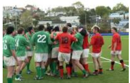
The Game against Ireland proved to be rather passionate