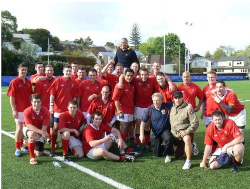
The victorious Welsh side who played and defeated the English.